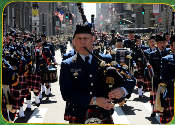
St Patrick's Day parade in New York.

5 St Patrick's Day is not only an Irish holiday. Irish immigrants began observing the holiday in Boston in 1737 and the first St Patrick's Day _____ was held in New York City in 1766. Today it has become a popular holiday which is celebrated all around the world. The Irish call this celebration cèilidh, which in Gaelic translates as a social gathering. _____ and _____ are traditional foods eaten on this holiday. Also, rivers are dyed green in honour of the day.