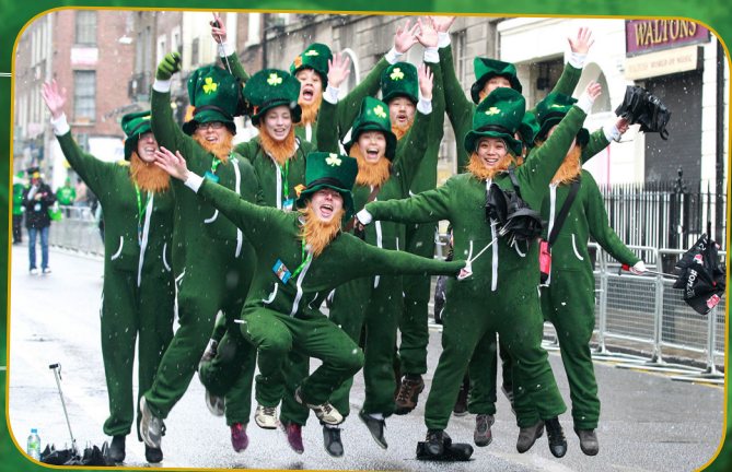
People dressed in green leprechaun costumes.

4 On this day many people wear _____, which is the Irish national colour. One of the Irish traditions is to pinch anyone who is not wearing green on St Patrick's Day. But, traditionally, St Patrick's colour was a light shade of blue, so he would also get pinched on his day.