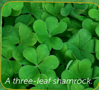
A three-leaf shamrock.

5 St Patrick's Day is not only an Irish holiday. Irish immigrants began observing the holiday in Boston in 1737 and the first St Patrick's Day _____ was held in New York City in 1766. Today it has become a popular holiday which is celebrated all around the world. The Irish call this celebration cèilidh, which in Gaelic translates as a social gathering. _____ and _____ are traditional foods eaten on this holiday. Also, rivers are dyed green in honour of the day.